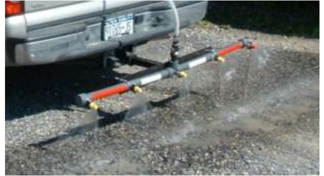
ADAPTOR USED TO CONNECT 1 ½" OR 2" SPRAY BARS TO HITCH OF TRUCK